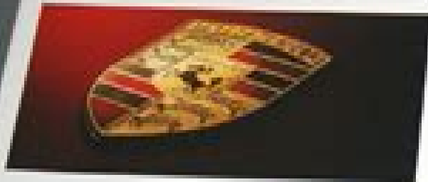
Service and Customer Information