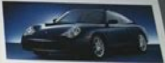
Quick Reference Guide Boxster