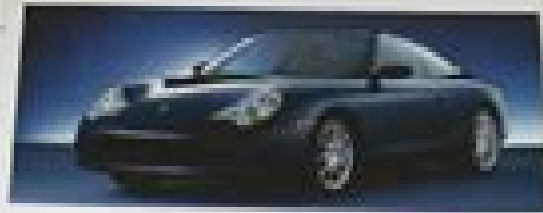
Owner's Manual Boxster