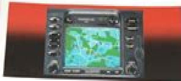
Porsche CarConnect infotainment Management (PCM)