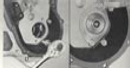
Fig. 2-98 Installing End Plate and Thrust Plate