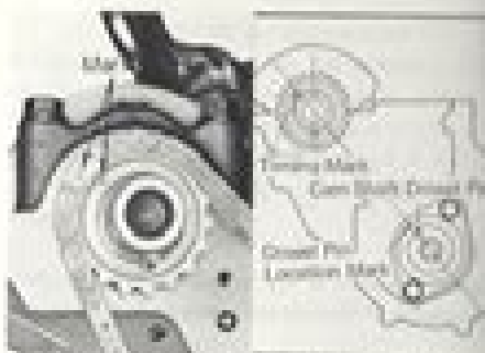
Fig. 2-99 Timing Chain Installation Position