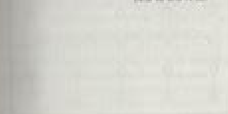
Fig. 2-102 Installing Timing Chain Cover