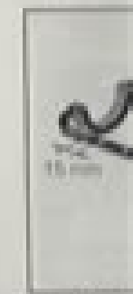
Fig. 2-105 Oil Pan Gasket Application