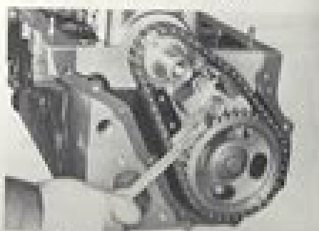
Fig. 2-101 Installing Chain Tensioner