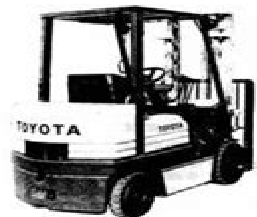
Vehicle Rear View