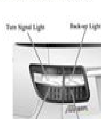
Turn Signal Light