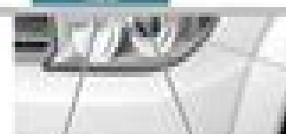
Headlight (High Beam)