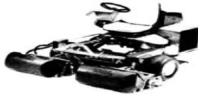
Greensmaster 3000-D, Model 04375