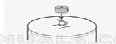
Typical Top Connect T & P Arrangement.

Slip the insulation cover over the T&P Valve through the center hole and align the hole in the side with the opening of the