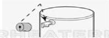
Typical Side Connect T & P Arrangement.

For increased energy efficiency, this water heater has been supplied with a 2 3/8" section of T&P insulation. Please install the insulation as shown below.