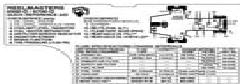
IN TOTAL BOOK (Part No. 93-3726) Quick Reference Aid

The following safety and instruction decals are affixed to the traction unit. If any decal becomes illegible or damaged, install a new decal. Part numbers are listed below and in your Parts Catalog.