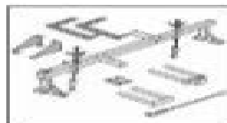
Motorbrug OE (00 0 200)