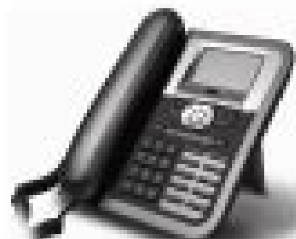
Model: 2540B 2540C 2540D 2540F

See the video series when setting up your new telephone