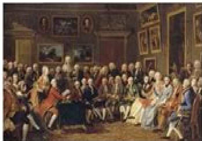
Le salon de Madame Geoffrin, peinture de J. David, 1787, Paris