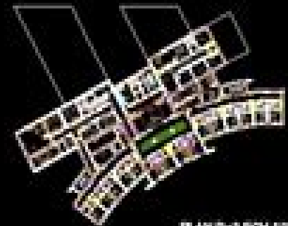
PLAN R+3 ECH 1/100