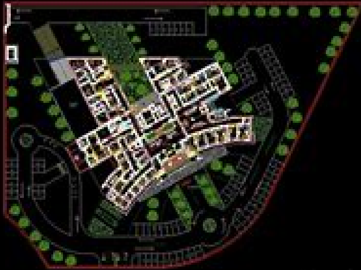
PLAN REC ECH 1/100