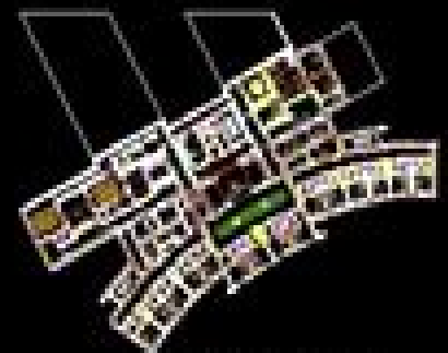
PLAN R+1 ECH 1/100