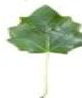
Grey Poplar Populus sp. canescens