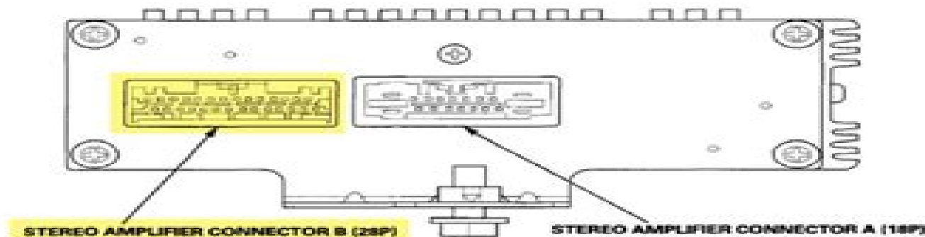
Fig. 32: Identifying Stereo Amplifier Connector For Inputs And Outputs Courtesy of AMERICAN HONDA MOTOR CO., INC.