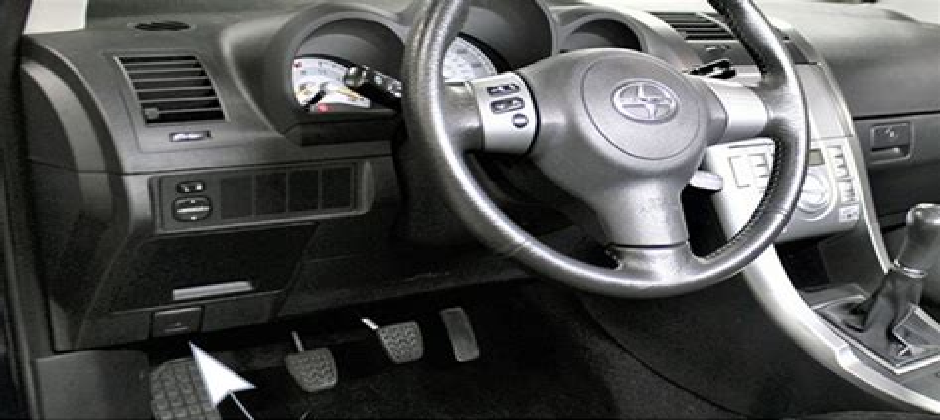
Instrument Panel Fuse Box