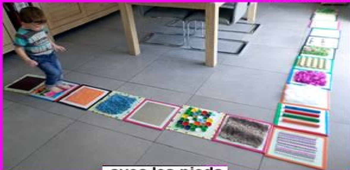
avec les pieds