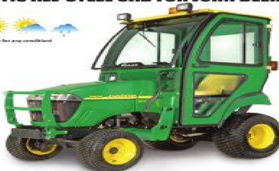
John Deere 2210 All-Steel Cab (P/N: L8009042) Shown with optional Cabair and Work Lights

All-Steel Cab Fits John Deere 2305 & 2210 Model Compact Tractors