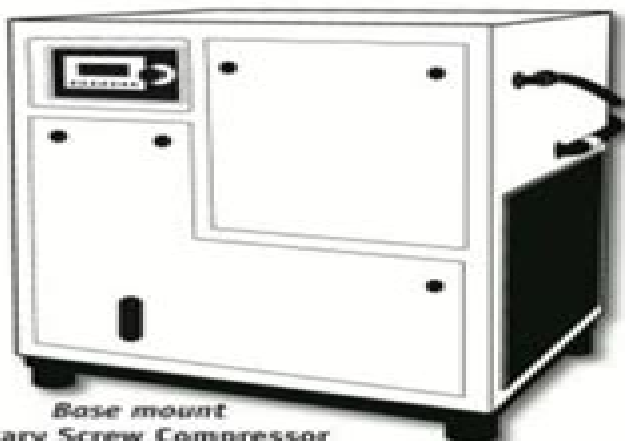
Base mount Rotary Screw Compressor

Polar Air designs and manufactures products for safe operation. However, operators and maintenance persons are responsible for maintaining safety. All safety precautions are included to provide a guideline for minimizing the possibility of accidents and property damage while equipment is in operation. Keep these instructions for reference.