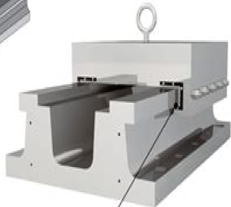
Roller Linear Guideway