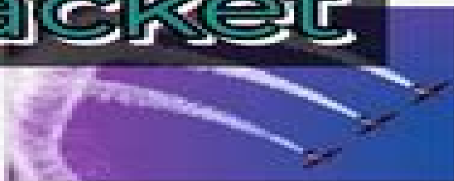
Unit 5: Polynomial Functions