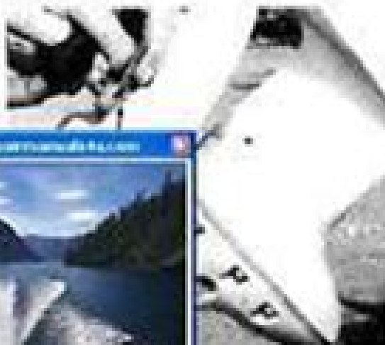
Pin, washer, and propeller. In this view, the shear pin hole is visible.

in and cause burrs on the hub. It may be difficult to remove burrs. To overcome burrs, the propeller hub has the full length of the prop turning, and then 1/4 turn to position the shear pin holes. The provided straight cut the welder has been removed on both sides of the hub.