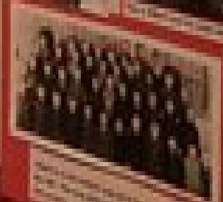
Albert Einstein, 1905