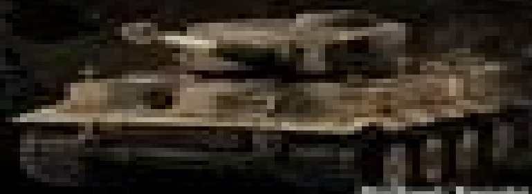
ILLUSTRATION BY [illegible]