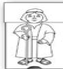
Paper Sack Puppet