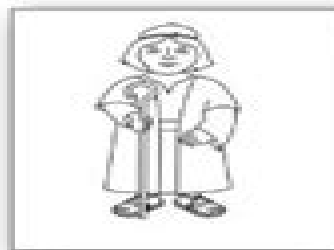
Flannel Board Figure

Note: If you do not wish to remove pages from the magazine, this activity may be copied, traced, or printed from the Internet at www.lds.org . Click on Gospel Library.