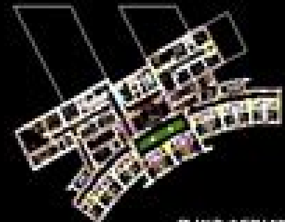
PLAN R+3 ECH 1/100