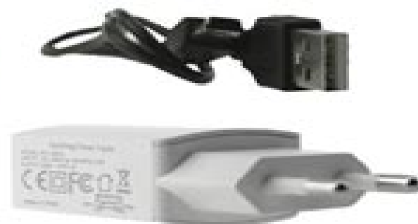
USB charger + cable