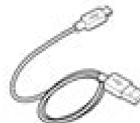
Micro USB cable