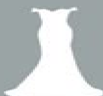
Off The Shoulder