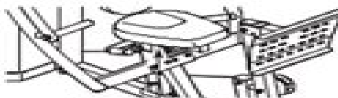
Serial Number Decal (Under Seat)

Write the serial number in the space above for future reference.