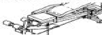
Serial Number Decal (Under Seat)

Write the serial number in the space above for future reference.