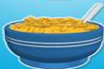
Macaroni & Cheese