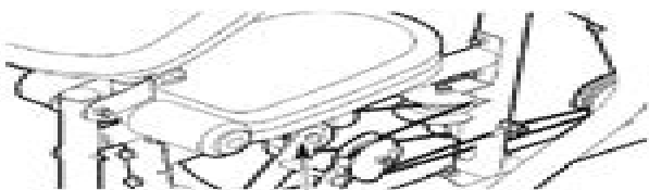
Serial Number Decal (under seat)

Write the serial number in the space above for future reference.