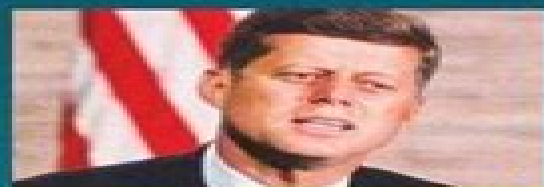
JFK: 60 YEARS LATER

YOUR COMPLETE GUIDE TO ALL THE NEW SHOWS