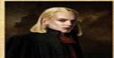
NAME: Caius A leader with Aro and Marcus Played by: Jamie Campbell Bower