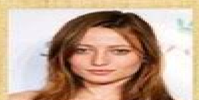
NAME: Heidi The bait in New Moon Played by: Noot Seer