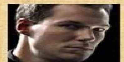
NAME: Felix A very strong member of the guard Played by: Daniel Cudmore