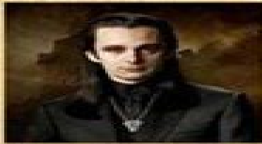
NAME: Aro Can see someone's thoughts past and present by touch alone. Played by: Michael Sheen