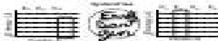
Diagram your solution with quantitative bar graphs and an energy flow diagram.