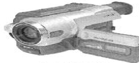
Photo : CCD-TRV408E

AEP Model UK Model East European Model North European Model Russian Model