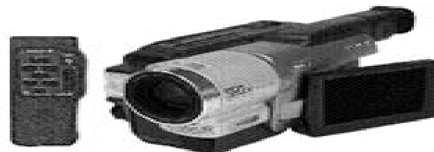
Photo : CCD-TRV98E

US Model CCD-TR618/TRV49E/TRV58E/TRV68E/TRV78E/TRV88E/TRV98E Canadian Model CCD-TR618/TRV49E/TRV58E/TRV68E/TRV78E/TRV88E/TRV98E AEP Model CCD-TR618/TRV49E/TRV58E/TRV68E/TRV78E/TRV88E/TRV98E E Model CCD-TR618E/TRV49E/TRV58E/TRV68E/TRV78E/TRV88E/TRV98E Australian Model CCD-TR618E/TRV49E/TRV58E/TRV68E/TRV78E/TRV88E/TRV98E Hong Kong Model CCD-TR618E/TRV49E/TRV58E/TRV68E/TRV78E/TRV88E/TRV98E Tourist Model CCD-TR618E/TRV49E/TRV58E/TRV68E/TRV78E/TRV88E/TRV98E Chinese Model CCD-TR618E/TRV49E/TRV58E/TRV68E/TRV78E/TRV88E/TRV98E Brazilian Model CCD-TR618E/TRV49E/TRV58E/TRV68E/TRV78E/TRV88E/TRV98E Argentina Model CCD-TR618E/TRV49E/TRV58E/TRV68E/TRV78E/TRV88E/TRV98E Korea Model CCD-TR618E/TRV49E/TRV58E/TRV68E/TRV78E/TRV88E/TRV98E