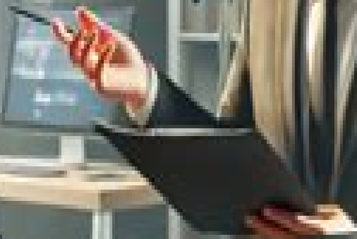
KAITLIN JOHNSON INSURANCE CLAIMS SUPPORT & ADJUSTER