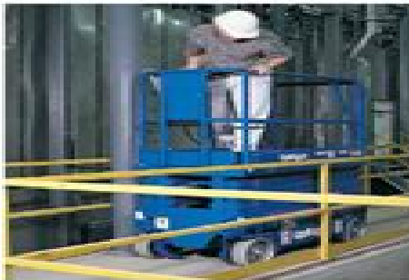
Compact dimensions and tight turning radius provides excellent manoeuvrability

Specifications subject to change without notice. Photos and diagrams in this brochure are for promotional purposes only. Refer to appropriate UpRight operations manual for detailed instructions on the proper use and maintenance.