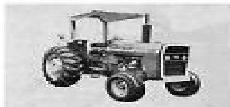
MF 255, MF 265 AND MF 275 TRACTORS