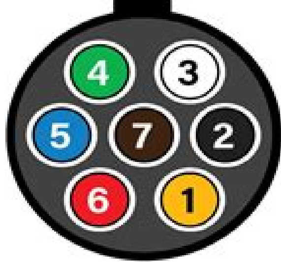
7 Pin Plug