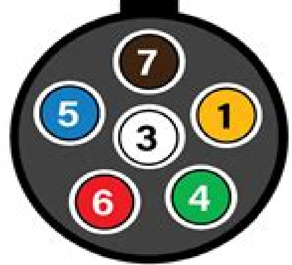
6 Pin Plug