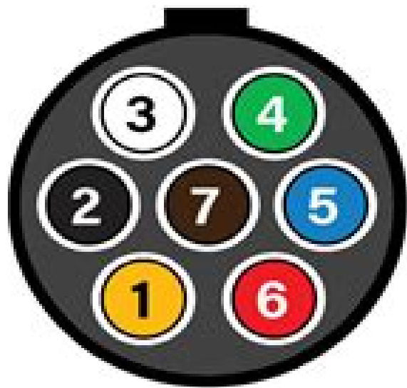
7 Pin Socket