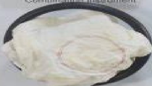
Driver side airbag