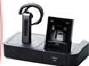
Jabra GO 6470