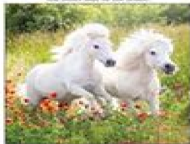
Believe your independence.