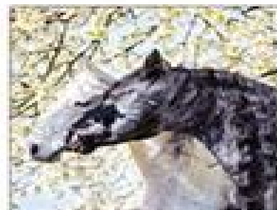
The most valuable thing you'll ever own is trust.