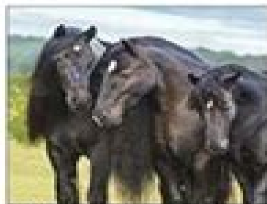
Show your friends you appreciate them.