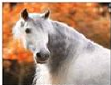
Stand out from the crowd.