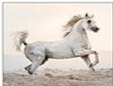
Be alert to what's in the wind.