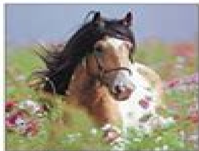
Take time to smell the flowers.