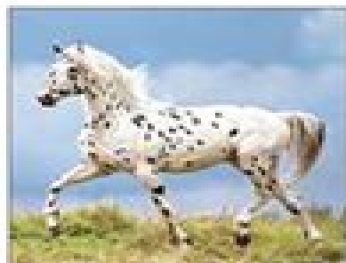
The grass isn't always greener on the other side of the fence.