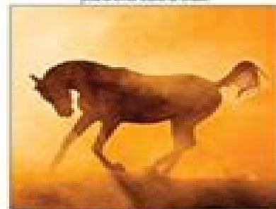
Whatever you do in life, try to enjoy the ride.