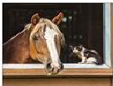
Companionship may be found in unexpected places.