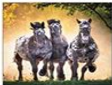
Give it all you've got.