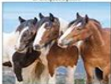
Stay close to your friends.