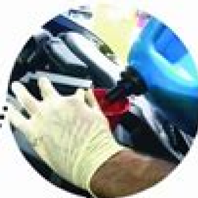
Low on oil