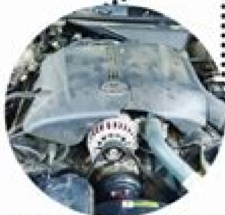
Issues with sensors found throughout the engine