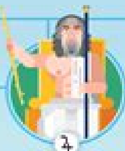
ZEUS God of the sky, lightning, and thunder