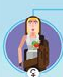
DEMETER Goddess of grain, growth, and the harvest