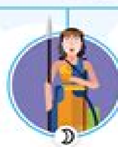
ARTEMIS Goddess of the hunt, wilderness, and wild animals