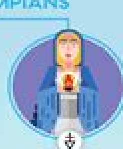
HESTIA Goddess of the hearth, domesticity, the family, the home, and the state