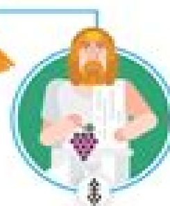
DIONYSUS God of the grape harvest, wine-making, and wine