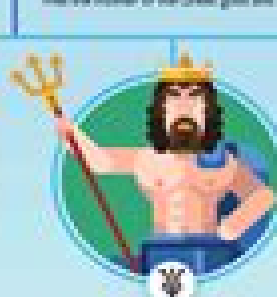
POSEIDON God of the sea