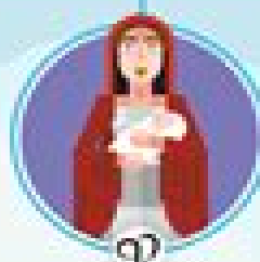
EILEITHYIA Goddess of childbirth