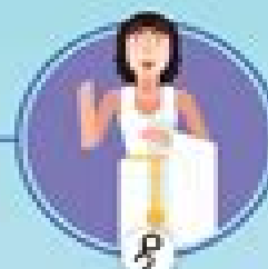
RHEA Goddess of female fertility and motherhood Was the mother of the Greek gods and goddesses