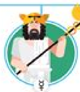
HERMES God of trade, wealth, luck, fertility, animal husbandry, sleep, language, thieves, and travel