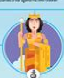
HERA Goddess of marriage and family