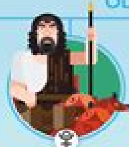
HADES God of the underworld