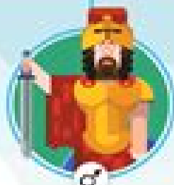
ARES God of war