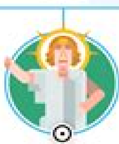
APOLLO God of music, truth, and prophecy