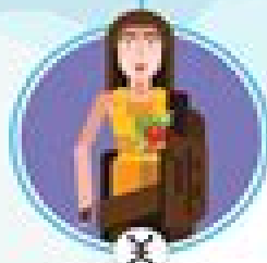
PERSEPHONE Goddess of springtime, vegetation, and the underworld