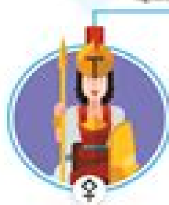
ATHENA Goddess of wisdom and military victory