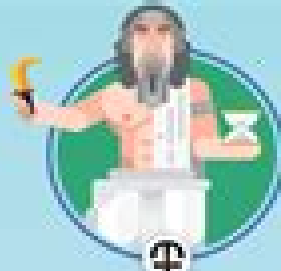
KRONOS God of time and agriculture Started a war against his own children