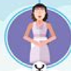
HEBE Goddess of youth