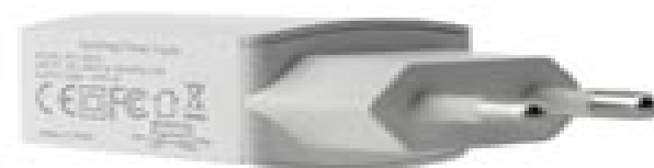
USB charger + cable