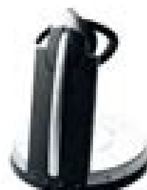
Jabra GN 9320