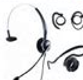
Jabra GN 2104