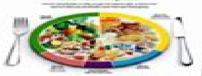
The eatwell plate

A healthy BALANCED diet contains the right balance of the different nutrients from foods you need and the right amount of energy. Mineral ions (e.g. iron, calcium) and vitamins (e.g. A, C, D) are needed in small amounts for healthy functioning of the body. If your diet is not BALANCED a person can become MALNOURISHED (e.g. over/underweight or suffer from a deficiency disease).