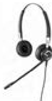
Jabra BIZ 2400 Duo