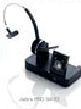
Jabra PRO 9400