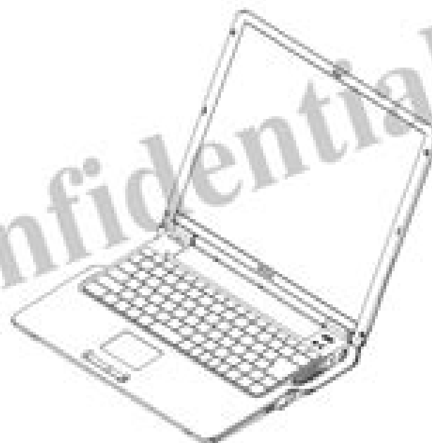
Ref : PCG-Z1XFP